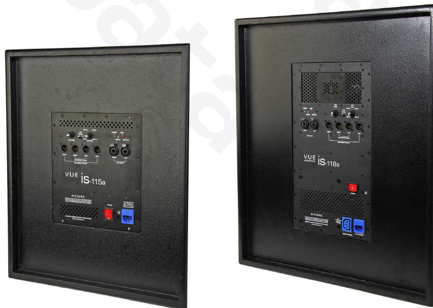
is-15a and is-18a rear panels